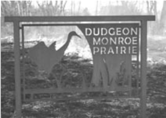
The Dudgeon Monroe Prairie benefits from an annual controlled burn to restore native vegetation.